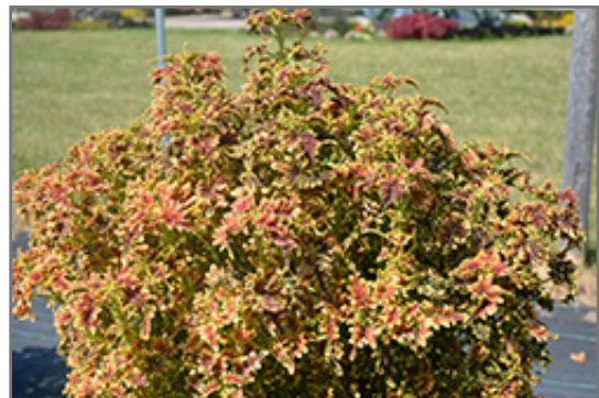
Under The Sea Copper Coral Coleus