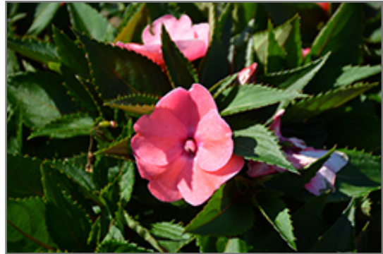
SunPatiens Spreading Shell Pink New Guinea Impatiens flowers

SunPatiens Spreading Shell Pink New Guinea Impatiens is recommended for the following landscape applications;