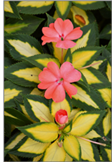
SunPatiens Spreading Salmon New Guinea Impatiens flowers

This plant will require occasional maintenance and upkeep, and should not require much pruning, except when necessary, such as to remove dieback. It is a good choice for attracting bees and butterflies to your yard. It has no significant negative characteristics.