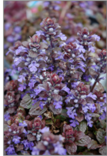
Bronze Beauty Ajuga flowers