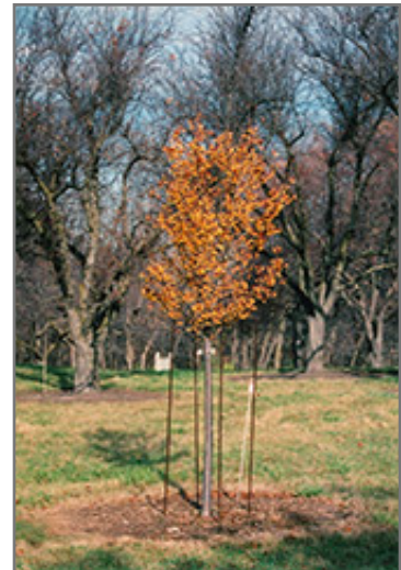
Lancelot Flowering Crab fruit