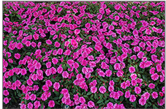
Bounce Pink Flame Impatiens in bloom