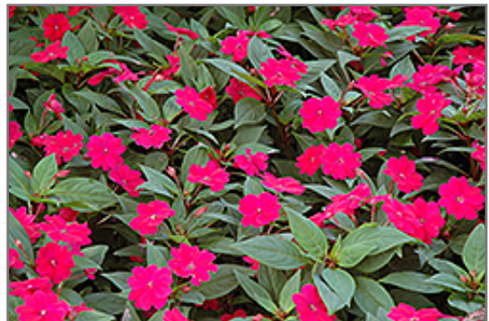
Bounce Cherry Impatiens in bloom