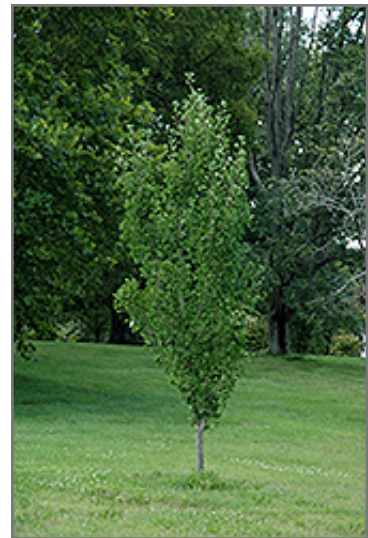
Presidential Gold Ginkgo