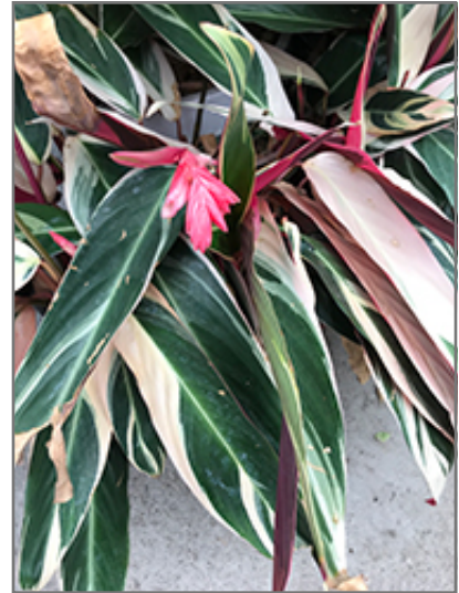
Tricolor Stromanthe flowers

This plant does best in full sun to partial shade. It prefers to grow in average to moist conditions, and shouldn't be allowed to dry out. It is not particular as to soil pH, but grows best in rich soils. It is somewhat tolerant of urban pollution. This is a selected variety of a species not originally from North America. It can be propagated by division; however, as a cultivated variety, be aware that it may be subject to certain restrictions or prohibitions on propagation.