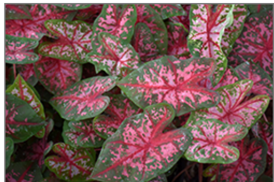
Carolyn Whorton Caladium foliage