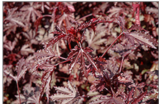
Haight Ashbury Hibiscus foliage