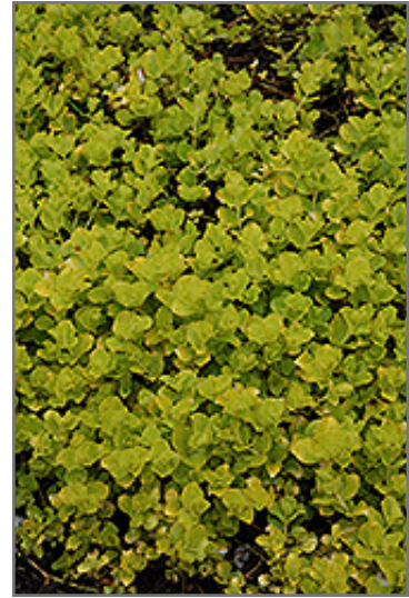
Golden Moneywort foliage

Golden Moneywort is recommended for the following landscape applications;