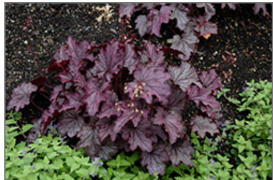
Spellbound Coral Bells