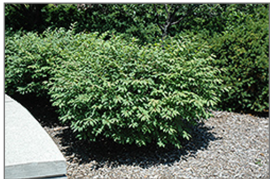
Fire Ball Eouonymus