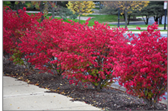
Fire Ball Eouonymus in fall

Fire Ball Eouonymus is recommended for the following landscape applications;