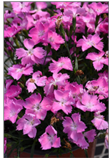
Kahori Dianthus flowers