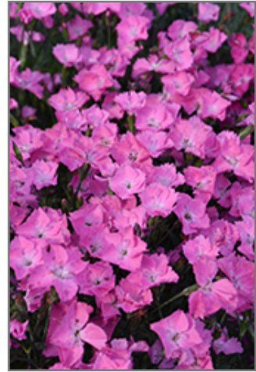
Kahori Dianthus flowers

Kahori Dianthus is recommended for the following landscape applications;