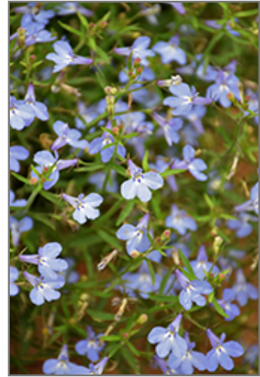
Techno Light Blue Lobelia flowers

Techno Light Blue Lobelia will grow to be about 8 inches tall at maturity, with a spread of 12 inches. When grown in masses or used as a bedding plant, individual plants should be spaced approximately 10 inches apart. Its foliage tends to remain low and dense right to the ground. Although it's not a true annual, this fast-growing plant can be expected to behave as an annual in our climate if left outdoors over the winter, usually needing replacement the following year. As such, gardeners should take into consideration that it will perform differently than it would in its native habitat.