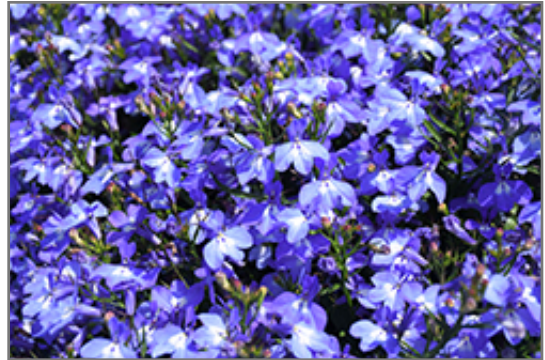
Techno Light Blue Lobelia flowers

Techno Light Blue Lobelia is recommended for the following landscape applications;