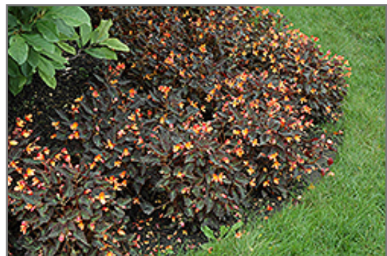
Sparks Will Fly Begonia in bloom