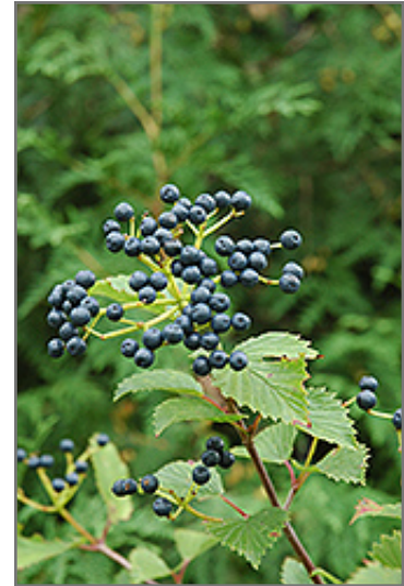
Blue Muffin Viburnum fruit

Blue Muffin Viburnum is recommended for the following landscape applications;