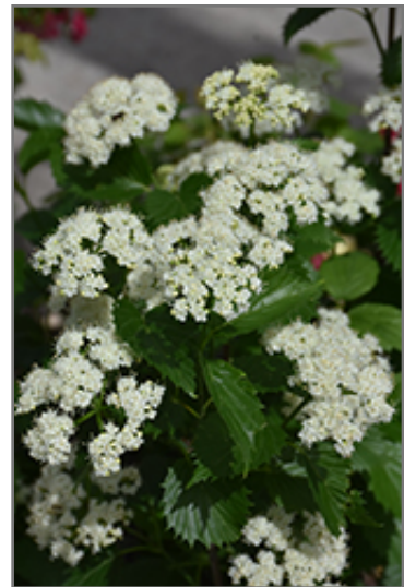
Blue Muffin Viburnum flowers