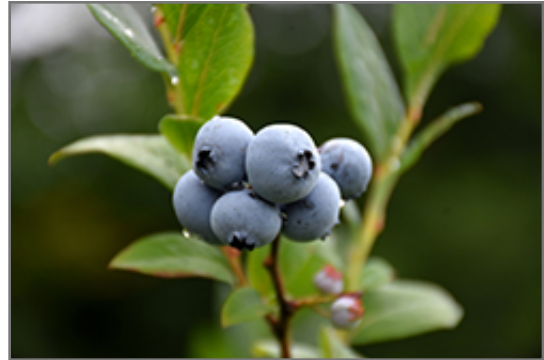
Northsky Blueberry fruit

Northsky Blueberry features dainty clusters of white bell-shaped flowers with shell pink overtones hanging below the branches in mid spring. It has green deciduous foliage. The glossy oval leaves turn an outstanding scarlet in the fall. It features an abundance of magnificent blue berries in mid summer.