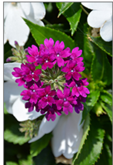
Superbena Royale Plum Wine Verbena flowers