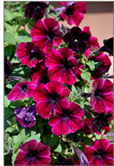
Sweetunia Johnny Flame Petunia flowers