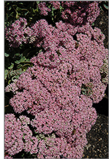
Lime Zinger Sedum flowers

This is a high maintenance plant that will require regular care and upkeep, and is best cleaned up in early spring before it resumes active growth for the season. It is a good choice for attracting bees and butterflies to your yard, but is not particularly attractive to deer who tend to leave it alone in favor of tastier treats. It has no significant negative characteristics.