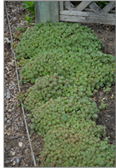
Lime Zinger Sedum

Lime Zinger Sedum will grow to be only 4 inches tall at maturity extending to 6 inches tall with the flowers, with a spread of 18 inches. When grown in masses or used as a bedding plant, individual plants should be spaced approximately 15 inches apart. Its foliage tends to remain low and dense right to the ground. It grows at a fast rate, and under ideal conditions can be expected to live for approximately 15 years. As an herbaceous perennial, this plant will usually die back to the crown each winter, and will regrow from the base each spring. Be careful not to disturb the crown in late winter when it may not be readily seen!