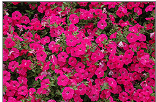
Tidal Wave Hot Pink Petunia in bloom