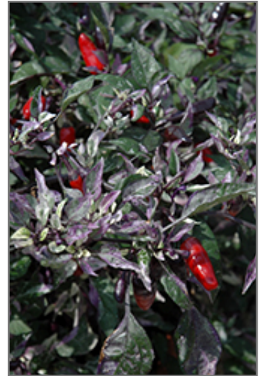
Calico Ornamental Pepper fruit