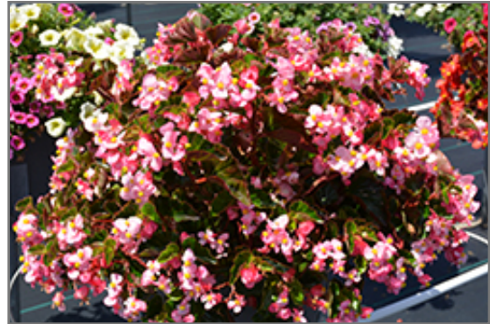
BabyWing Pink Begonia in bloom

BabyWing Pink Begonia is a fine choice for the garden, but it is also a good selection for planting in outdoor containers and hanging baskets. It is often used as a 'filler' in the 'spiller-thriller-filler' container combination, providing a mass of flowers and foliage against which the thriller plants stand out. Note that when growing plants in outdoor containers and baskets, they may require more frequent waterings than they would in the yard or garden.