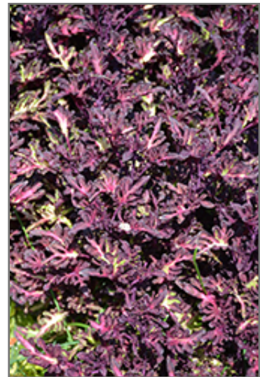
Merlin's Magic Coleus foliage