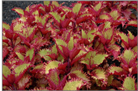
Henna Coleus foliage