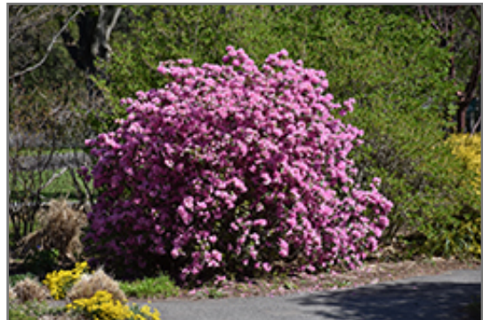
P.J.M. Elite Rhododendron in bloom