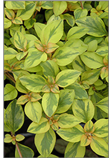
Walkabout Sunset Loosestrife foliage

Walkabout Sunset Loosestrife is recommended for the following landscape applications;