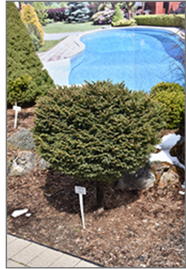
Little Gem Spruce (tree form)