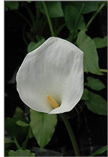
Calla Lily flowers

Calla Lily is recommended for the following landscape applications;