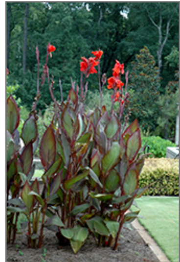
Australia Canna in bloom