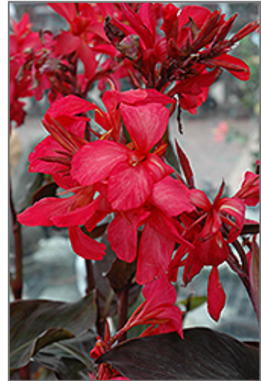
Australia Canna flowers

This plant should only be grown in full sunlight. It requires an evenly moist well-drained soil for optimal growth, but will die in standing water. It is not particular as to soil pH, but grows best in rich soils. It is highly tolerant of urban pollution and will even thrive in inner city environments, and will benefit from being planted in a relatively sheltered location. Consider applying a thick mulch around the root zone in winter to protect it in exposed locations or colder microclimates. This particular variety is an interspecific hybrid. It can be propagated by division; however, as a cultivated variety, be aware that it may be subject to certain restrictions or prohibitions on propagation.