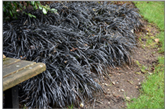
Black Mondo Grass

Black Mondo Grass is recommended for the following landscape applications;