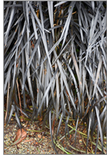
Black Mondo Grass foliage

At Shelmerdine, we treat this plant as a "HOBBY PLANT" meaning that it is not recognized as winter-hardy in our Zone 3 climate. However, there is a possibility that it could survive winter. Regardless of whether it survives a winter or not, this plant is only warrantied until Nov. 1 of its season of purchase.