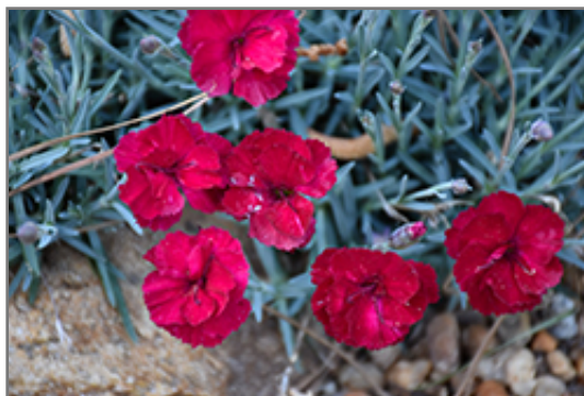
Frosty Fire Pinks flowers

7800 Roblin Boulevard Headingley, MB R4H 1B6