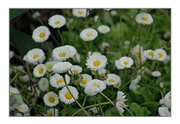
Rominette White English Daisy flowers