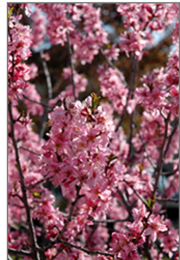
Muckle Plum (tree form) flowers