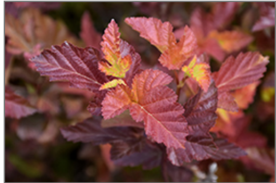
Center Glow Ninebark foliage

Center Glow Ninebark is recommended for the following landscape applications;