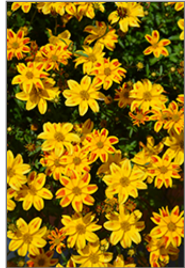
Beedance Red Stripe Bidens flowers

Beedance Red Stripe Bidens is recommended for the following landscape applications;