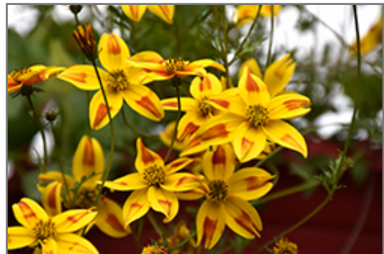
Beedance Red Stripe Bidens flowers