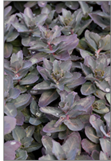
Cherry Truffle Stonecrop foliage

Cherry Truffle Stonecrop is a fine choice for the garden, but it is also a good selection for planting in outdoor pots and containers. It is often used as a 'filler' in the 'spiller-thriller-filler' container combination, providing a mass of flowers and foliage against which the larger thriller plants stand out. Note that when growing plants in outdoor containers and baskets, they may require more frequent waterings than they would in the yard or garden. Be aware that in our climate, most plants cannot be expected to survive the winter if left in containers outdoors, and this plant is no exception. Contact our experts for more information on how to protect it over the winter months.