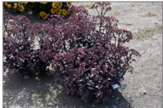
Cherry Truffle Stonecrop in bloom