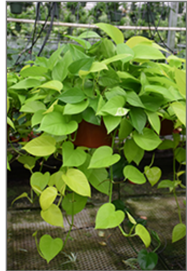
Neon Pothos in full

When grown indoors, Neon Pothos can be expected to grow to be about 5 feet tall at maturity, with a spread of 24 inches. It grows at a fast rate, and under ideal conditions can be expected to live for approximately 10 years. This houseplant performs well in both bright or indirect sunlight and strong artificial light, and can therefore be situated in almost any well-lit room or location. It does best in average to evenly moist soil, but will not tolerate standing water. The surface of the soil shouldn't be allowed to dry out completely, and so you should expect to water this plant once and possibly even twice each week. Be aware that your particular watering schedule may vary depending on its location in the room, the pot size, plant size and other conditions; if in doubt, ask one of our experts in the store for advice. It is not particular as to soil type or pH; an average potting soil should work just fine. Be warned that parts of this plant are known to be toxic to humans and animals, so special care should be exercised if growing it around children and pets.