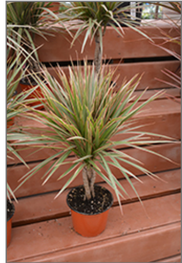
Colorama Dracaena in full

When grown indoors, Colorama Dracaena can be expected to grow to be about 3 feet tall at maturity, with a spread of 24 inches. It grows at a medium rate, and under ideal conditions can be expected to live for approximately 10 years. This houseplant performs well in both bright or indirect sunlight and strong artificial light, and can therefore be situated in almost any well-lit room or location. It does best in average to evenly moist soil, but will not tolerate standing water. The surface of the soil shouldn't be allowed to dry out completely, and so you should expect to water this plant once and possibly even twice each week. Be aware that your particular watering schedule may vary depending on its location in the room, the pot size, plant size and other conditions; if in doubt, ask one of our experts in the store for advice. It is not particular as to soil type or pH; an average potting soil should work just fine.