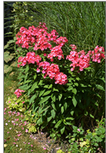
Flame Coral Garden Phlox in bloom

7800 Roblin Boulevard Headingley, MB R4H 1B6