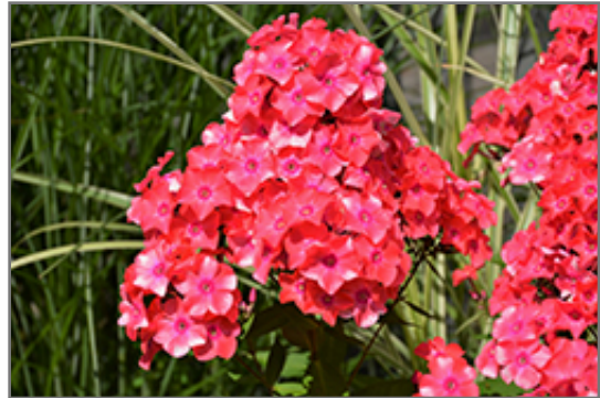
Flame Coral Garden Phlox flowers

This plant will require occasional maintenance and upkeep, and should be cut back in late fall in preparation for winter. It is a good choice for attracting butterflies and hummingbirds to your yard. Gardeners should be aware of the following characteristic(s) that may warrant special consideration;