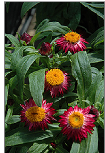
Mohave Dark Red Strawflower flowers

7800 Roblin Boulevard Headingley, MB R4H 1B6