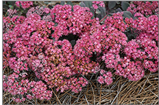
Dazzleberry Stonecrop flowers

Dazzleberry Stonecrop is a dense herbaceous perennial with an upright spreading habit of growth. Its medium texture blends into the garden, but can always be balanced by a couple of finer or coarser plants for an effective composition.