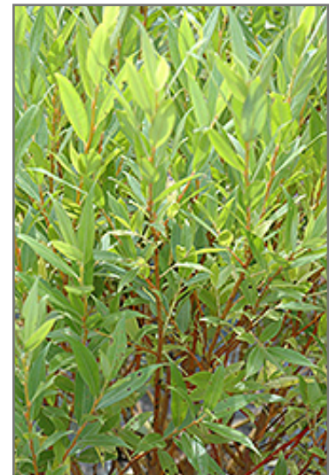
Flame Willow foliage