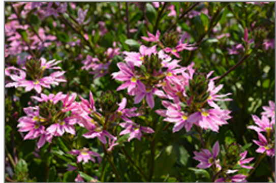
Bombay Pink Fan Flower flowers

Bombay Pink Fan Flower is recommended for the following landscape applications;