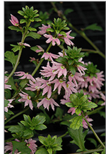
Bombay Pink Fan Flower flowers

7800 Roblin Boulevard Headingley, MB R4H 1B6