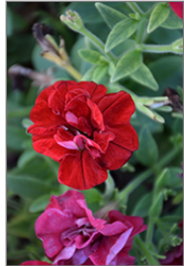
SweetSunshine Red Petunia flowers