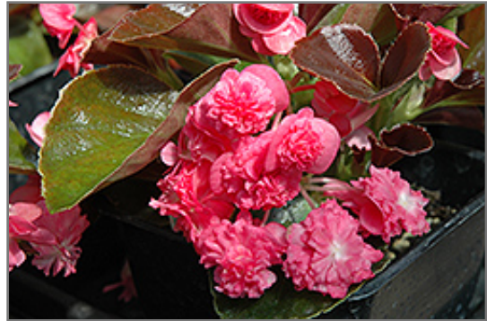
Doublet Rose Begonia flowers