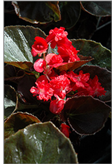
Doublet Red Begonia flowers