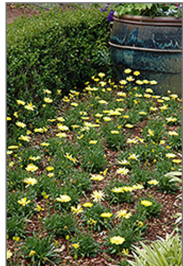
Voltage Yellow African Daisy flowers

7800 Roblin Boulevard Headingley, MB R4H 1B6